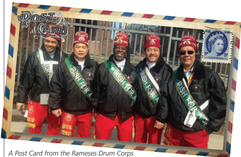
A Post Card from the Rameses Drum Corps on parade for the St. Patrick's Day Parade in Toronto, "Irish for a day"